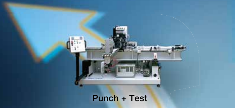
Punch + Test